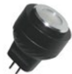
LED Lamp Included