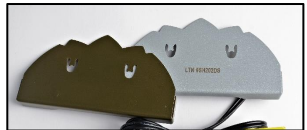
Two Housing Colors